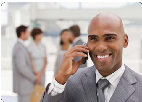
All the standard functions and more!